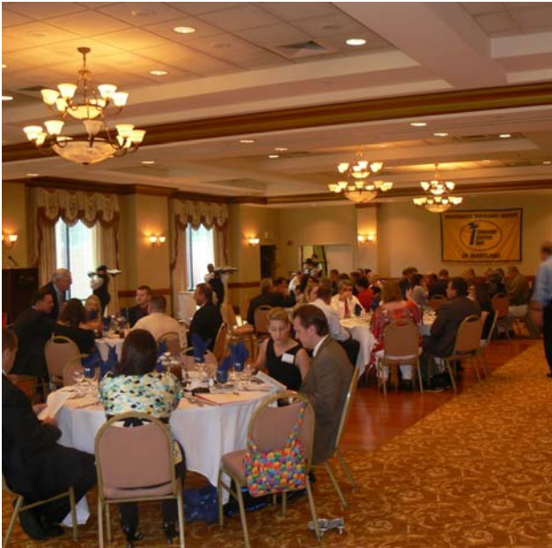
The Group prepares for a wonderful dinner of crabcakes and filet mignon!