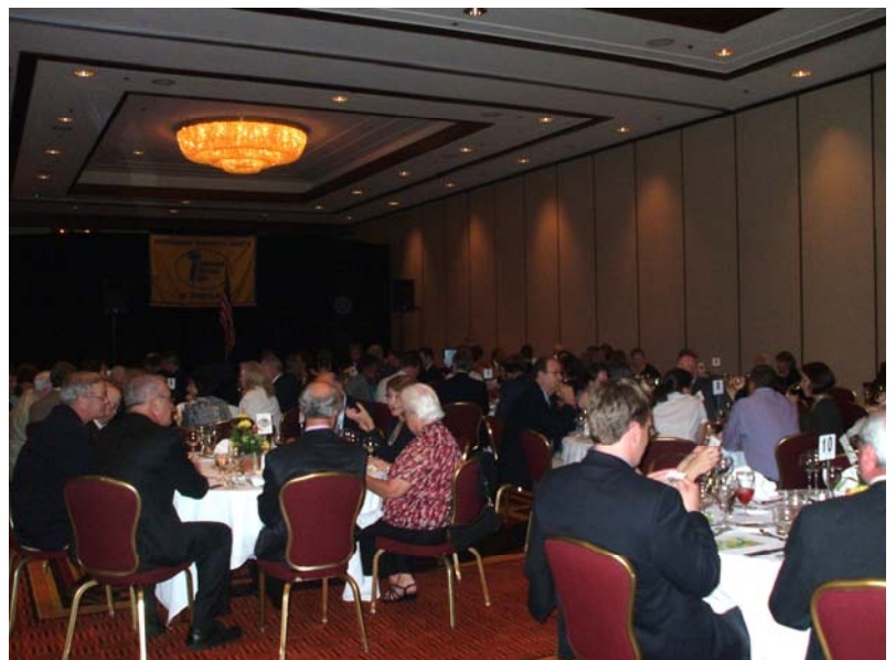
Attendees get ready to dine on a most wonderful meal!