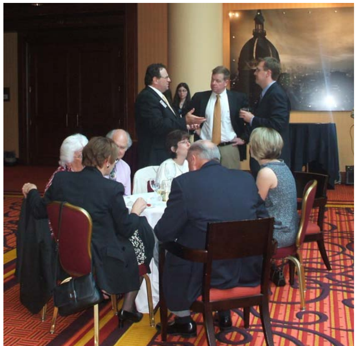
Old friends gather at the reception