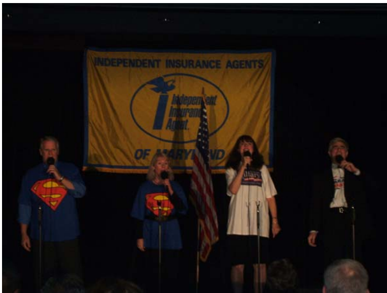
Attendees were more than pleased with the 'Capitol Steps'. A premiere entertainment group that puts the 'mock' in democracy!